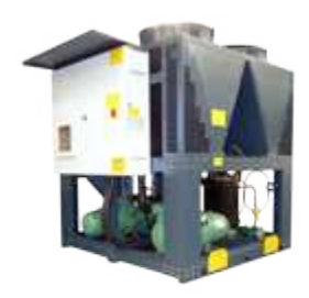
VSA B228A AC 04