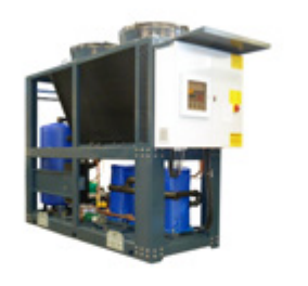
VSA B228A AC 04