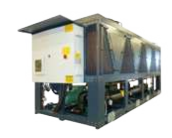
GHA B 270A ES EC-34 - SPEC