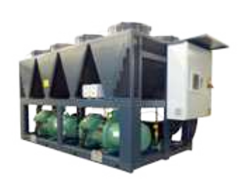
GHA B 2160 A AC-34