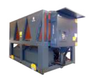
GHA B240A EC-34 TP SP